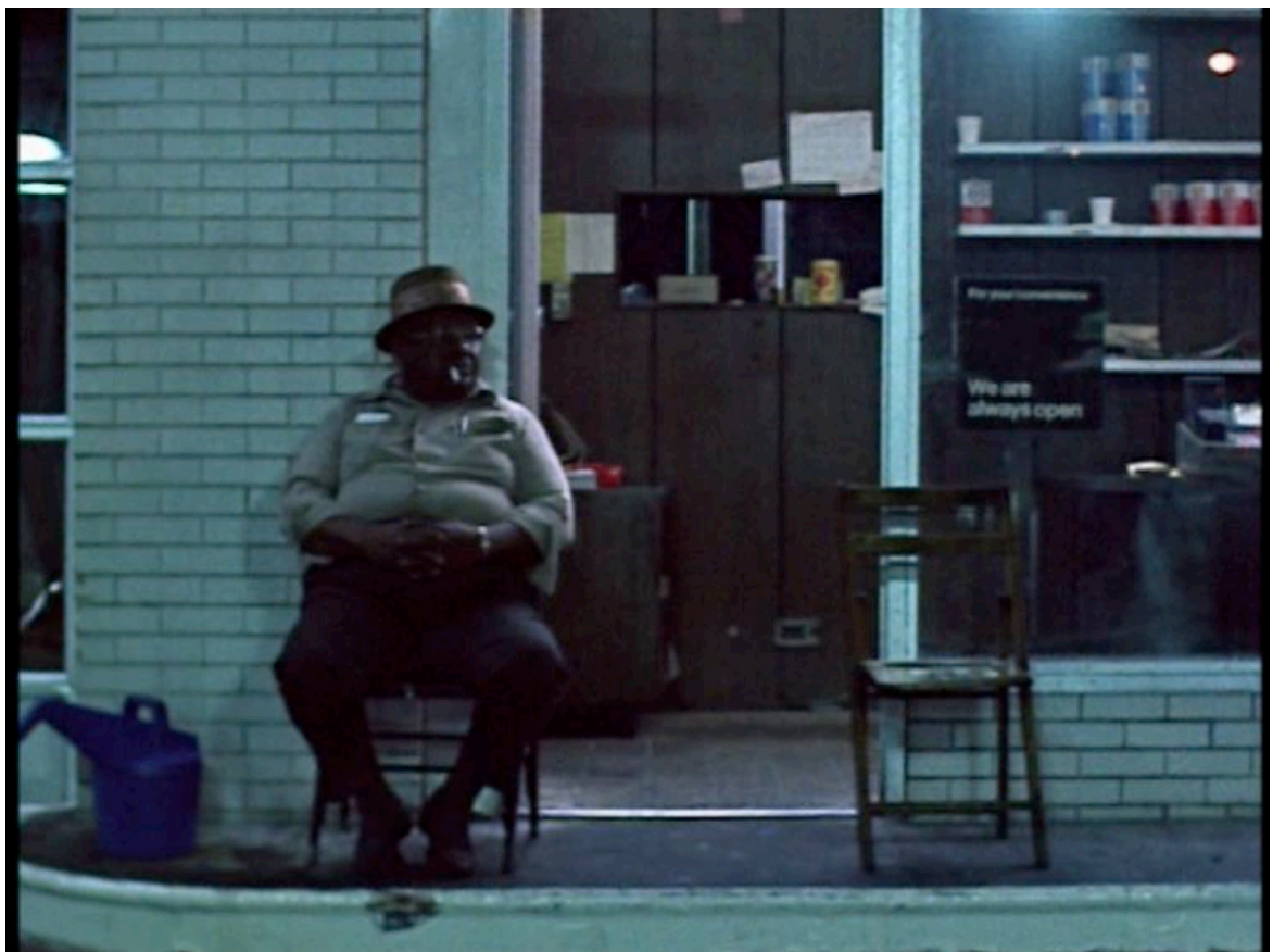
Illustration 4 — film still from News from Home , Chantal Akerman, 1976