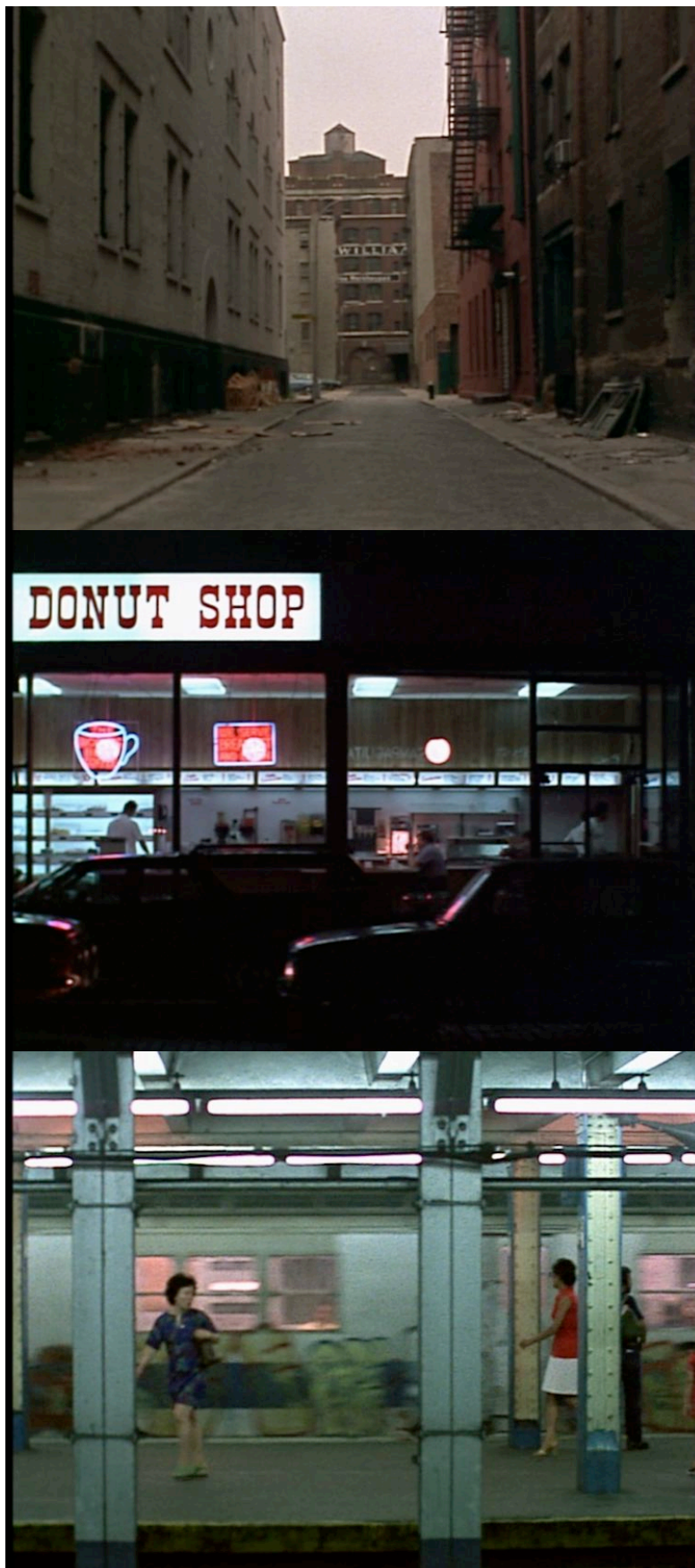
Illustration 2 – film stills from News from Home , Chantal Akerman, 1976