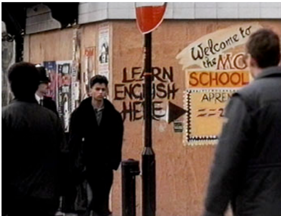
Illustration 6 — film still from London , Patrick Keiller, 1994