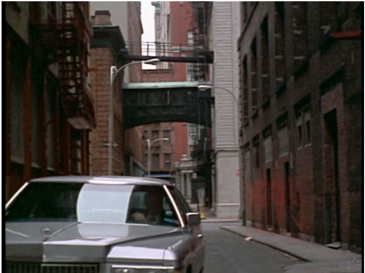
Illustration 3 — film still from News from Home , Chantal Akerman, 1976