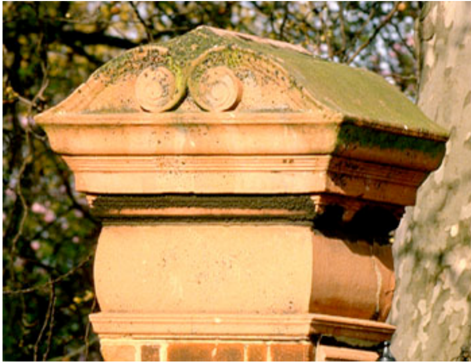
Illustration 5 — film still from London , Patrick Keiller, 1994